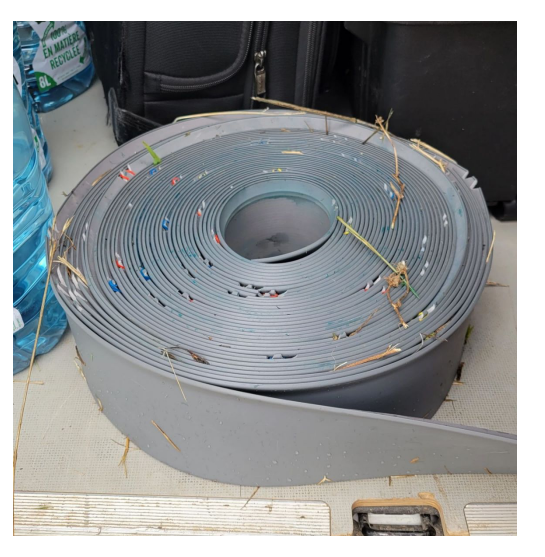
Easy to store and transport