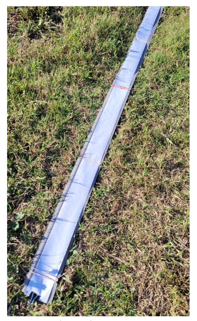
Paper secured to vinyl

Vinyl cove molding is a convenient way to make swath boards, which hold the paper collectors flat and stable. By cutting some slits into the sides at regular intervals, you can use rubber bands to attach the collection paper to the vinyl. Once you have finished collecting data, the vinyl can be easily rolled back up for transportation. You can have up to 45 meters in a roll that is still small enough to fly with.